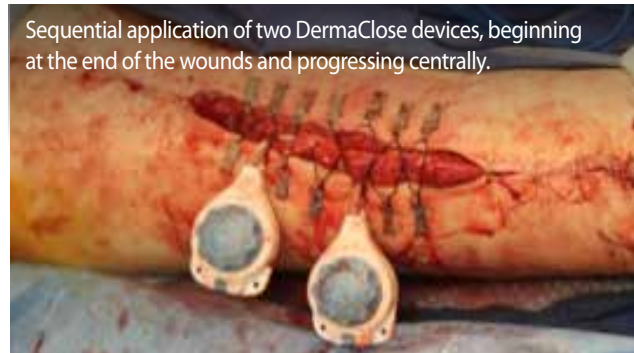
Sequential application of two DermaClose devices, beginning at the end of the wounds and progressing centrally.