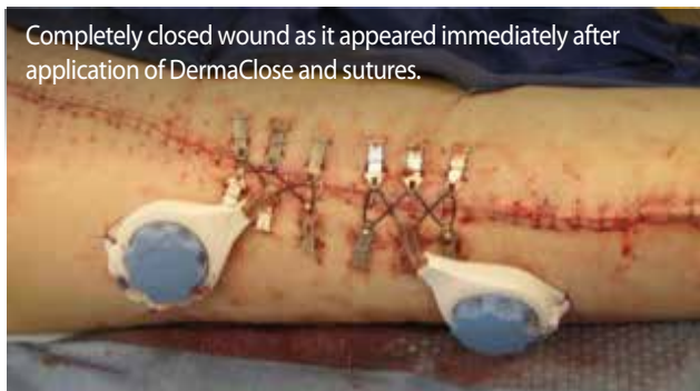
Completely closed wound as it appeared immediately after application of DermaClose and sutures.