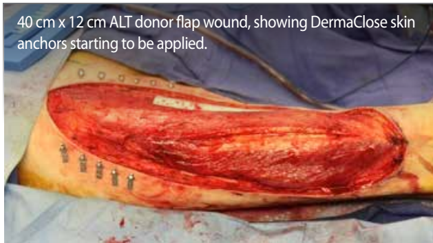
40 cm x 12 cm ALT donor flap wound, showing DermaClose skin anchors starting to be applied.