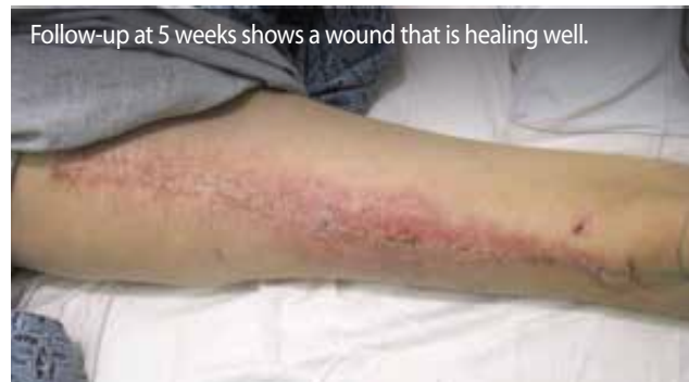
Follow-up at 5 weeks shows a wound that is healing well.

A typical DermaClose case: DermaClose used in primary closure of large anterolateral thigh donor site defect.